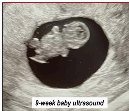
9-week baby ultrasound