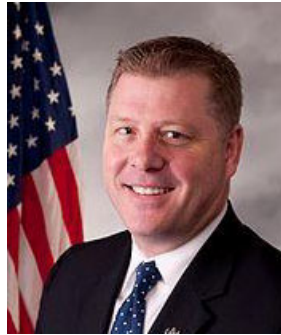
✓ Congressman Rick Crawford (R) District 1