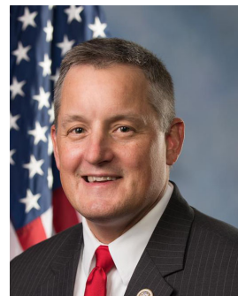
✓ Congressman Bruce Westerman (R) District 4