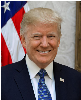
✓ President Donald Trump (R) U. S. PRESIDENT