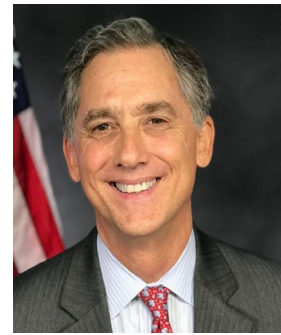
✓ Congressman French Hill (R) District 2