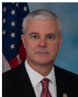
✓ Congressman Steve Womack (R) District 3