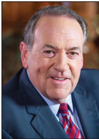
Governor Mike Huckabee Keynote Speaker