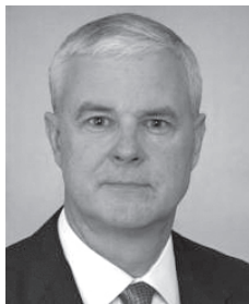
✓ 3 rd District Congressman Steve Womack – R