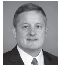
✓ 4 th District Congressman Bruce Westerman - R